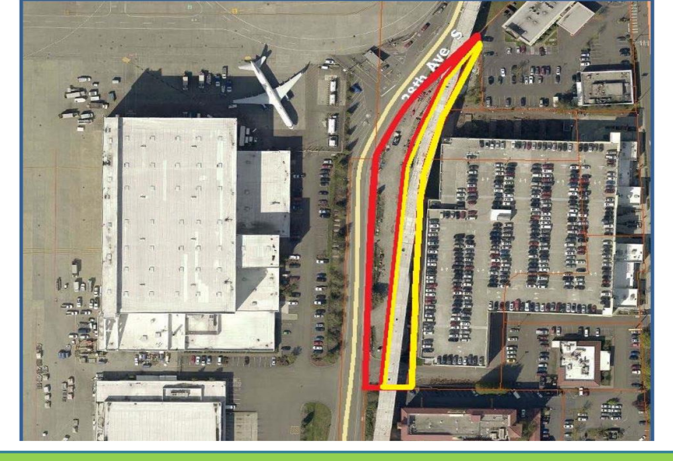
Red is MOA Parcel / Yellow is blocked property